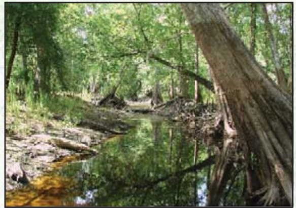
Withlacoochee River in the Green Swamp near Dade City

Visit WaterMatters.org/Withlacoochee for a list of model scenarios and additional information.